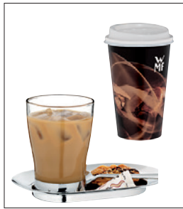
Wide Selection of Milk and Espresso drinks