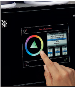
User Friendly Interface